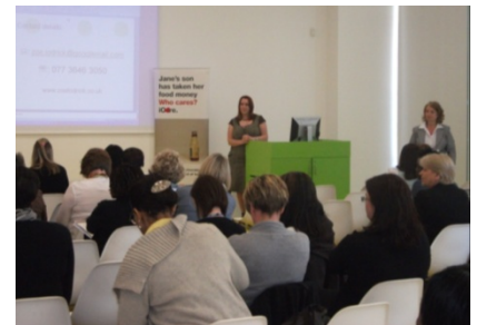
'Why Victims Don't Leave' Conference May 2011