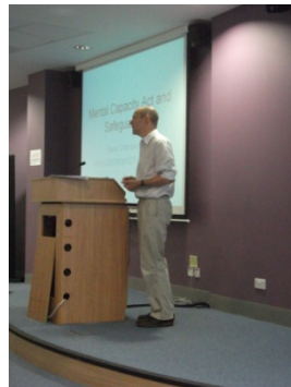
Deprivation of Liberty Safeguard Conference at Queens Hospital July 2011