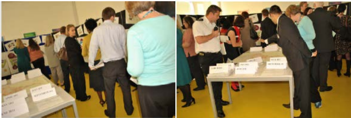
Safeguarding Adults Board Business Planning Day October 2011

"Barking and Dagenham Safeguarding Adults Board are committed to protecting the human and civil rights of adults at risk".