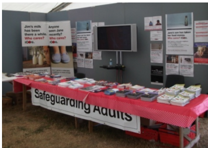
Town Show July 2011

Safeguarding Adults aspects of commissioning and contracting have been improved in 2011 through improved systems of information sharing between the two service areas.