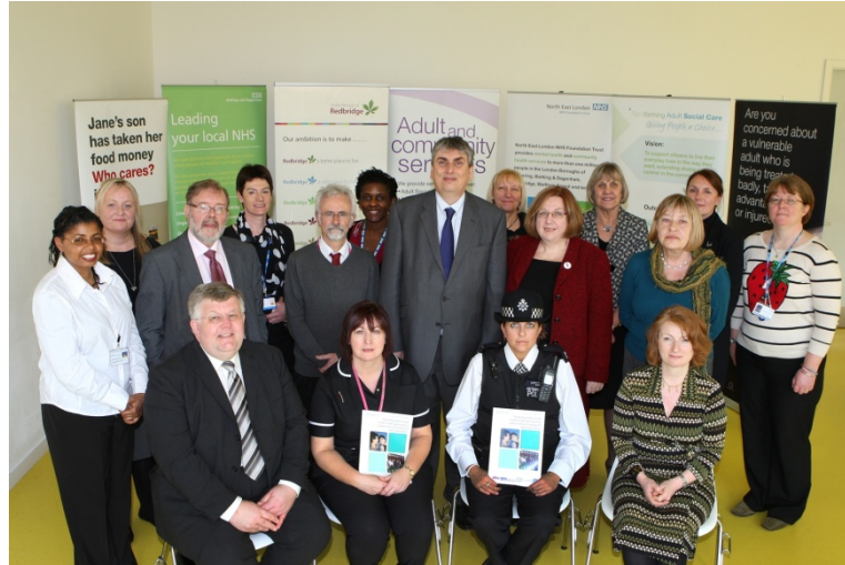
Regional Launch of 'Protecting Adults At Risk; London multi-agency policy and procedures to safeguard adults from abuse' April 2011

Safeguarding Adults data was included within the 2011 Joint Strategic Needs Assessment for Barking and Dagenham. This has enabled safeguarding priorities to become embedded within future commissioning plans across health and social care.