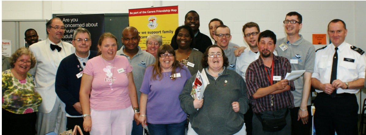
Learning Disability Awareness Week - Hate Crime June 2011

A Safeguarding Adults Session was held on the 7 th December with members of Silvernet, the new Barking and Dagenham Forum for Older People.